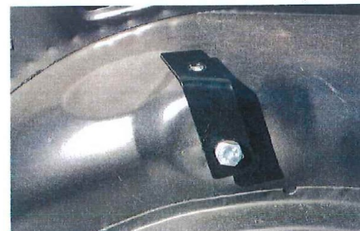
Fig 3 Seat Belt Bracket (RH) located.

In these instances the additional spacers, reinforcement plates and split washers supplied in the kit should not be used. Simply locate the seat belt bracket by placing the short 7/16" bolt, with a spring washer through bracket and place a star washer between bracket and boss. Use a socket to tighten (to approximately 30-35 ft lbs), ensuring that the bracket remains in a horizontal position once secured (See Fig 3). On completion refer to the separate seat belt mounting instructions to complete the installation.