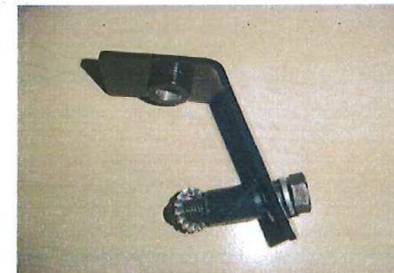
Fig 7 Bracket pre- assembly