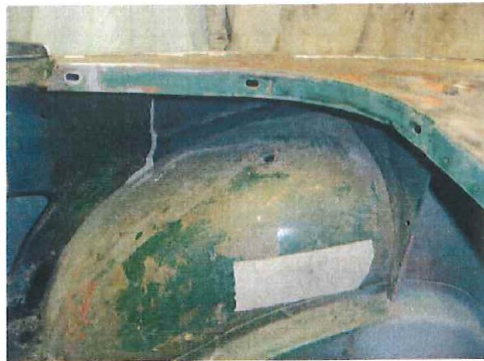
Fig 4 Masking off the wheel arch for marking.