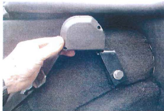
Fig9 Final Installation NB Inertia Mechanism mounted horizontally

To ensure correct operation the belts should be mounted on a horizontal plane (Fig 9). On completion refer to the separate seat belt mounting instructions to complete the installation.