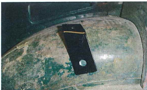
Fig 1 identifying the brackets (RH shown)

Belt mounting brackets are handed. To identify correctly, the bracket should be placed against the wheel arch as shown below (Fig 1). Correct fitment results in a bracket angled towards the front of the car, with the top plane mounted in a horizontal position.