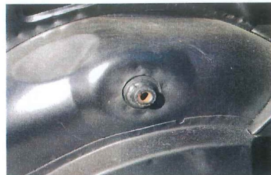
Fig 2 Pre-Installed Rear Seat Belt Mountings

Some Midget models will already have factory installed rear seat belt mountings on the side of the wheel arches (indicated by a raised threaded boss welded to the cockpit side of the wheel arch see Fig 2),