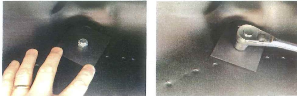
Fig 8 Anchor plate attachment

10. Repeat this procedure for either side of the vehicle, replacing the road wheels and carpets on completion.