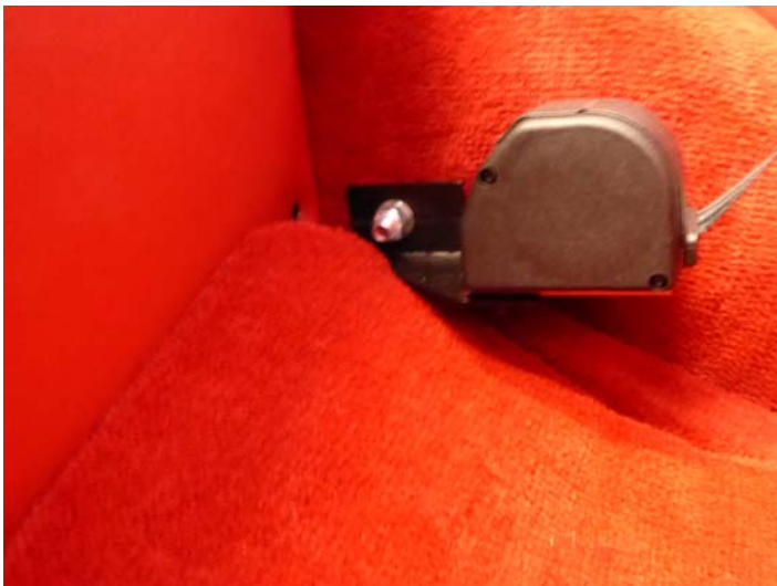
LEFT HAND SEAT BELT