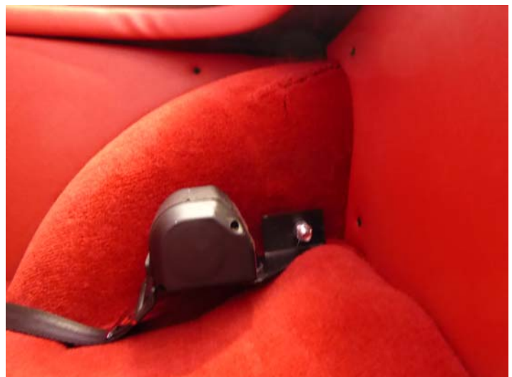
RIGHT HAND SEAT BELT